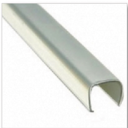
Polished Aluminum Trim 400.129 – for .045" and .060"