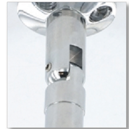
Swivel Top Mount 400.117 (kit)