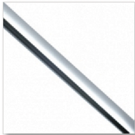
Alum. mounting channel 400.104

Fusion Hardware is a sleek, contemporary and attractive hardware system available for the installation of Fusion Screens and Fusion translucent panels. An extensive line of panel hardware is available including tracks, ceiling & floor connectors, and wire and panel connectors. More information is available on other mounting systems as well.