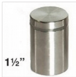
1 1/2" Brushed Stainless Standoff 400.119 – 2" barrel length 400.125 – 3" barrel length 400.126 – 4" barrel length