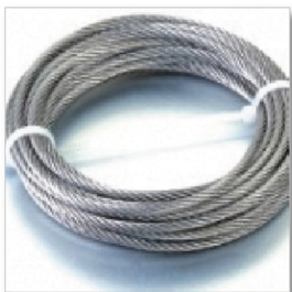
Hardware Cable 13' 400.100