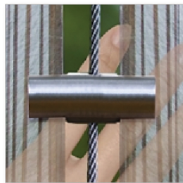
Side Mount Double Panel Clamp 400.108