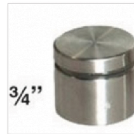
3/4" Brushed Stainless Standoff 400.120 – 2" barrel length 400.121 – 3" barrel length 400.122 – 4" barrel length