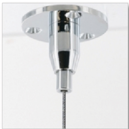
Fixed Ceiling Mount 400.103