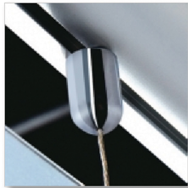
Channel Ceiling Connector 400.105