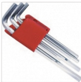
Hex Keys Set of Three 400.111