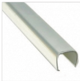
Brushed Aluminum Trim 400.130 – for .120", 4' 400.131 – for .120", 8'