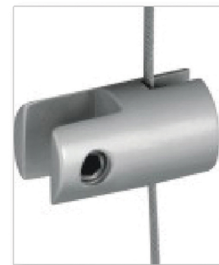
Side Mount Single Panel Clamp 400.107