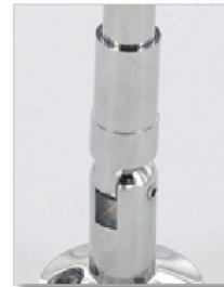
Swivel Bottom Mount 400.117 (kit)