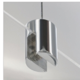
Top/Bottom Panel Mount Connector 400.110