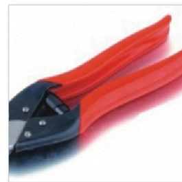
Cable Cutter 400.112