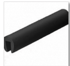
Black Rubber Trim 400.128