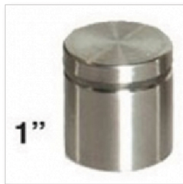
1" Brushed Stainless Standoff 400.118 – 2" barrel length 400.123 – 3" barrel length 400.124 – 4" barrel length