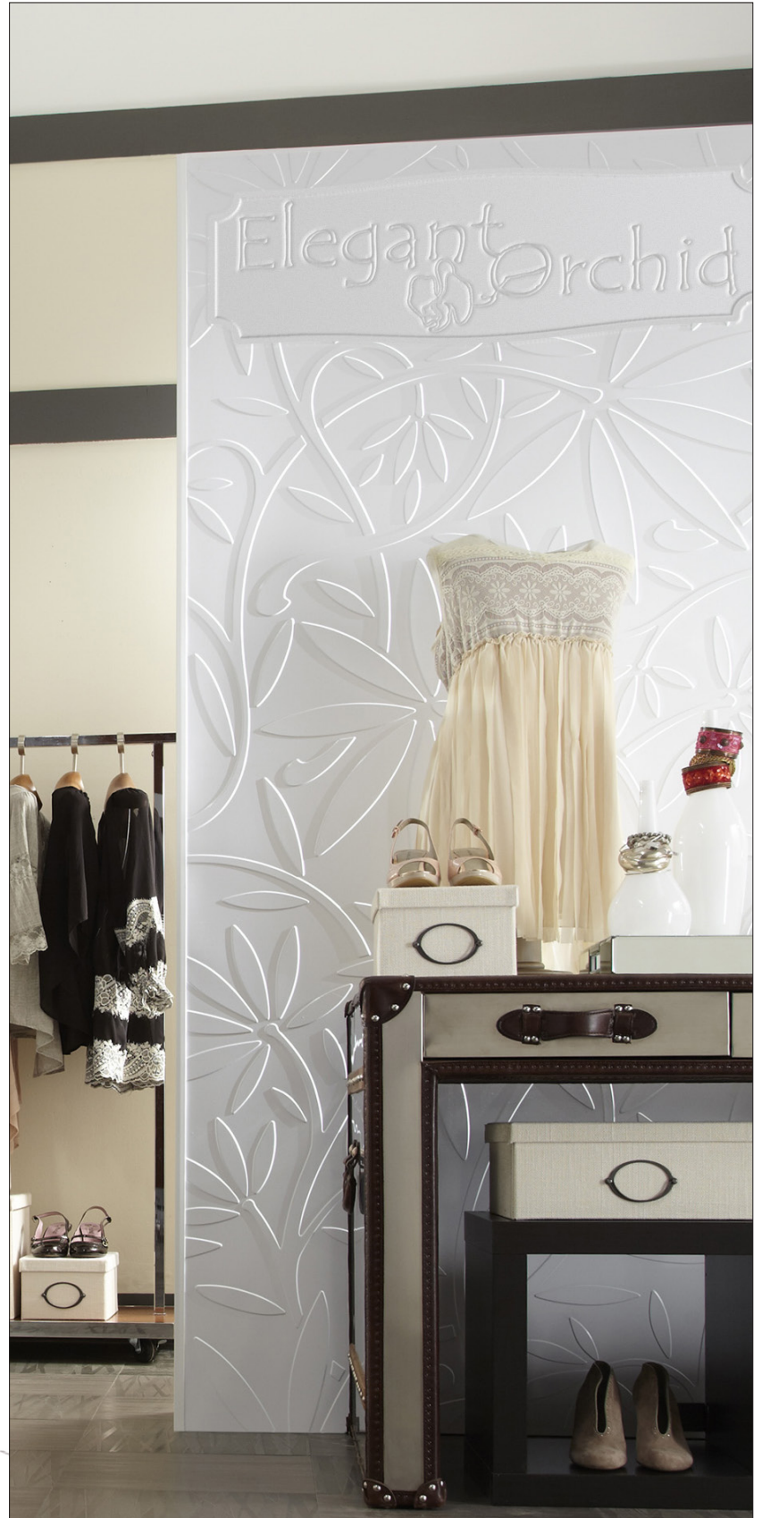
Custom Tooled MirroFlex Panel with Audrey pattern