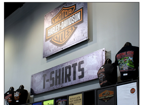
PurePrint featuring printed Branding Materials