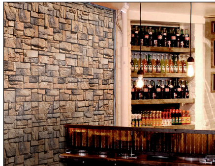
PurePrint featuring printed Stone