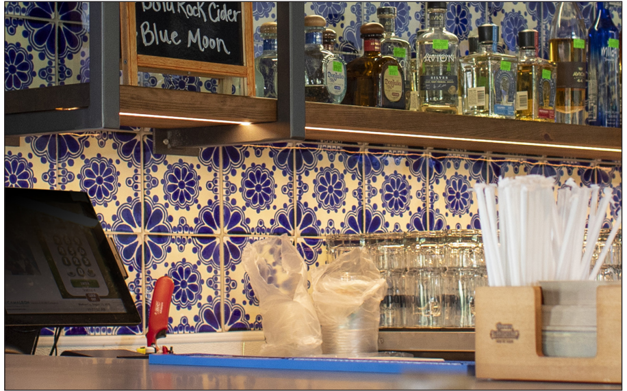
PurePrint featuring printed Mexican Tiles