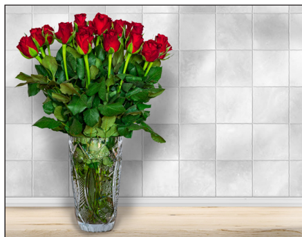
PurePrint featuring printed White Marble Tiles