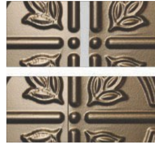
Bead + Button