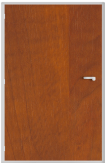
Medium Cherry N575