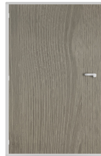
Weathered Oak N621