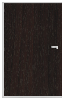
Dark Walnut N578