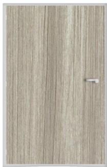
Concrete Groovz N626