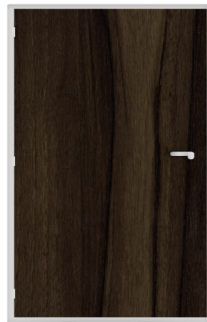
Noce Secchia N601