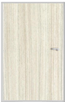
Artic Groovz N629