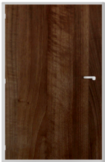
Medium Walnut N577