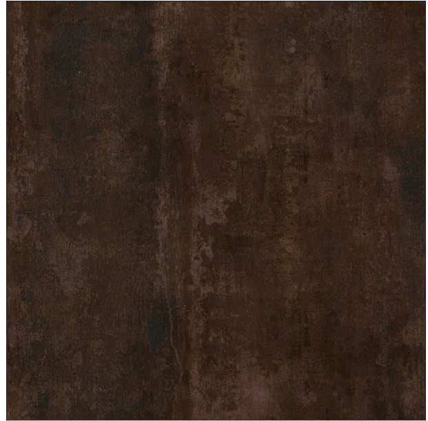
Abstract Copper N632