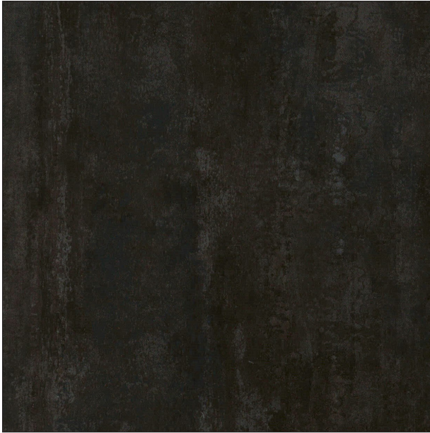
Abstract Bronze N633

We are excited to introduce our collection of new MirroFlex™ finishes. Our latest release offers three new finishes inspired by the richest metallic hues and one soft gray. All made with an elegant matte finish.