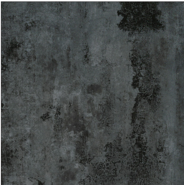
Abstract Silver N634