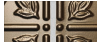
Bead + Button