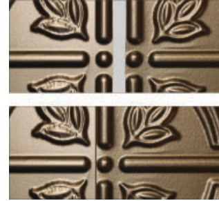
Bead + Button