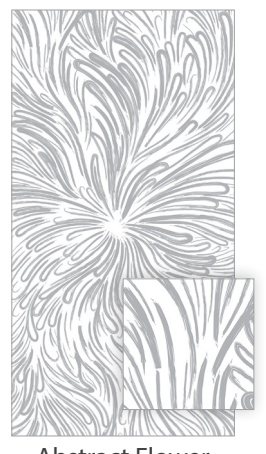
Abstract Flower Frosted