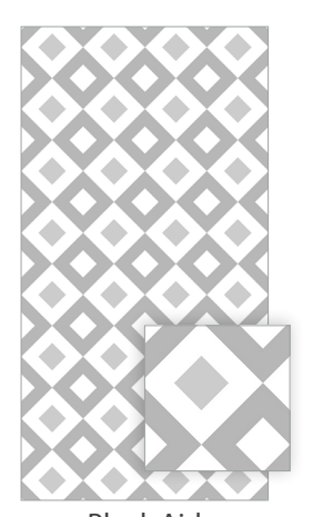
Block Aid Frosted