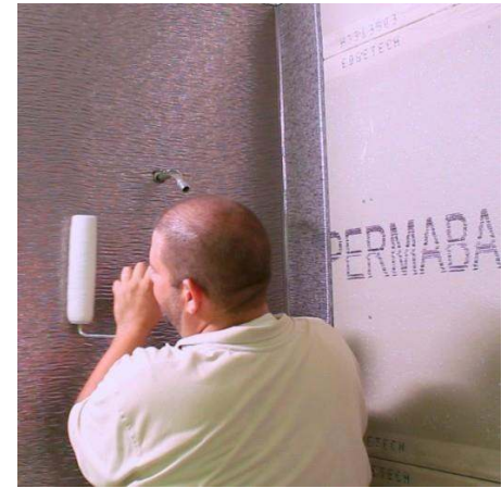
Figure 7 Figure 8 Figure 9