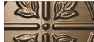
Bead + Button