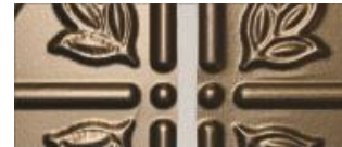
Bead + Button